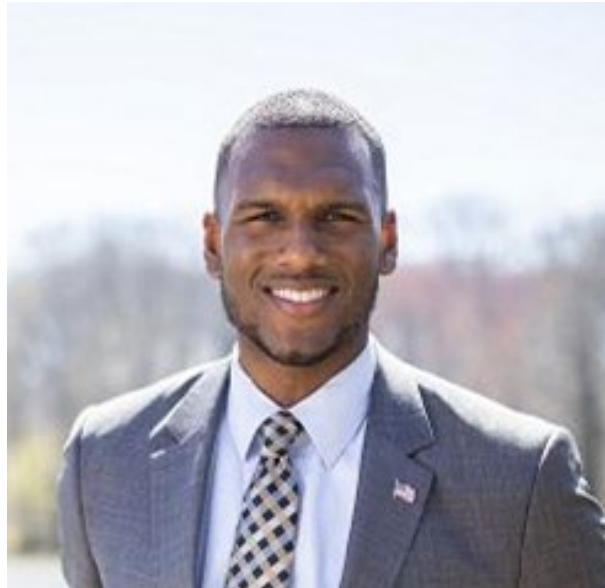
Charles Fall (Government Management track) NY Assembly Member for the New York's 61st Assembly District.