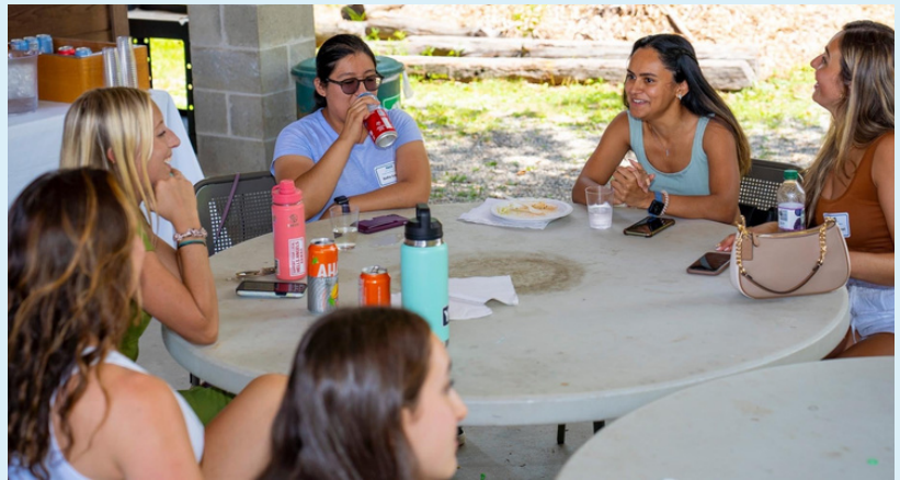
Welcoming Cohort 5 at Orientation.