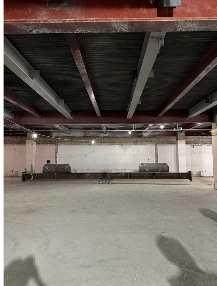
Rigging and installation of enabling Truss is ongoing. Bolting, rigging and welding to occur.