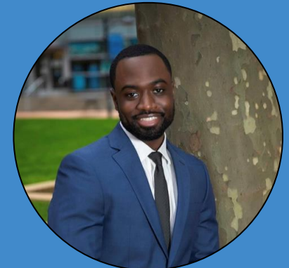
One Card Coordinator New York City Campus