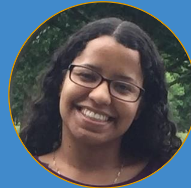
One Card Coordinator Pleasantville Campus