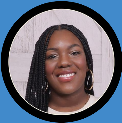
Dining Compliance Manager