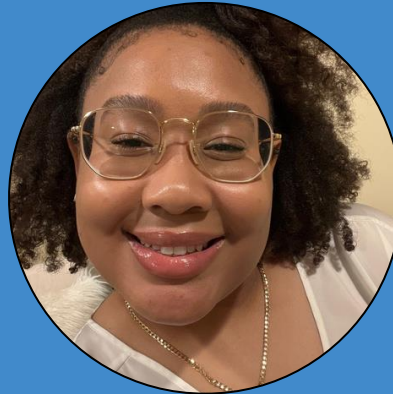
Administrative Student Operations Manager