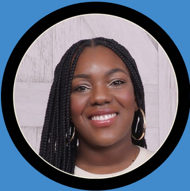
Dining Compliance Manager