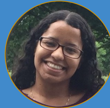
One Card Coordinator Pleasantville Campus