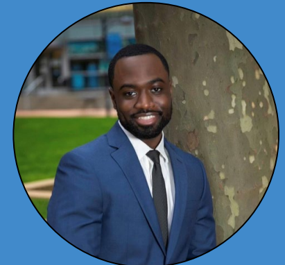
One Card Coordinator New York City Campus