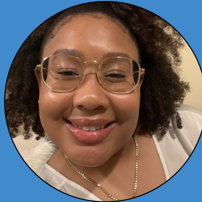
Administrative Student Operations Manager