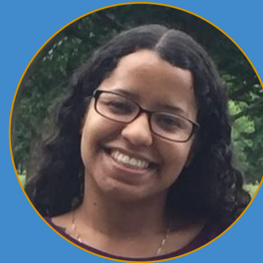
One Card Coordinator Pleasantville Campus