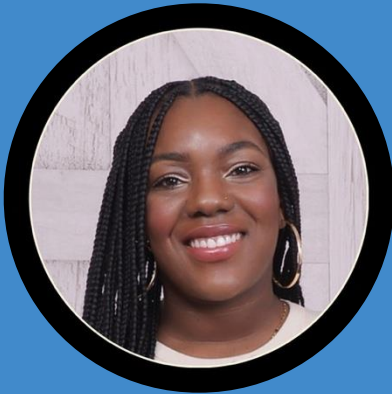
Dining Compliance Manager