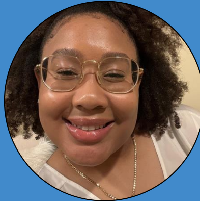
Administrative Student Operations Manager