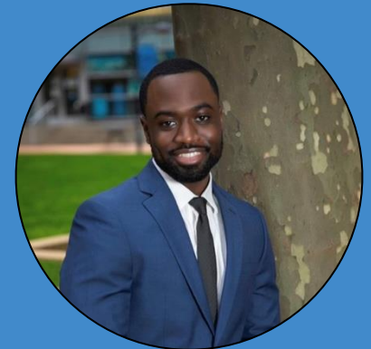
One Card Coordinator New York City Campus