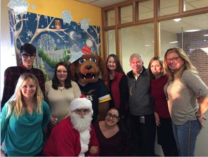
HR employees (staff and students) gathered to celebrate the holiday season!